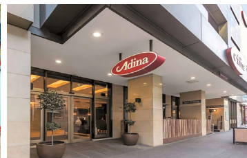
Adina Apartment Hotel Melbourne