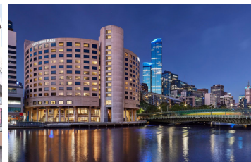
Crowne Plaza Hotel Melbourne